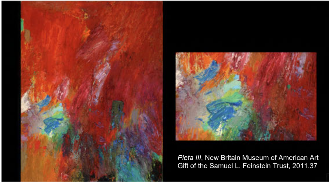
Pieta III , New Britain Museum of American Art Gift of the Samuel L. Feinstein Trust, 2011.37